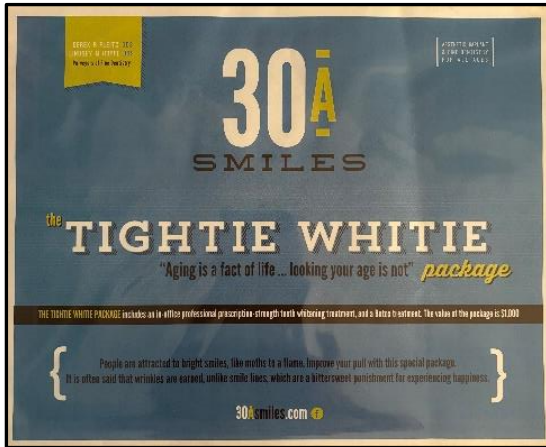
Professional In-Office Teeth Cleaning & Botox Treatment Donated by: 30A Smiles