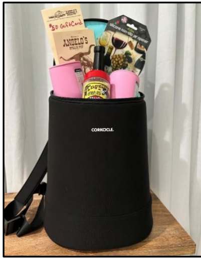
Angelo's Steak Pit Basket including $50 Gift Card Donated by: Angelo's Steak Pit