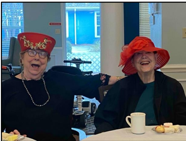
"Charter's Red Hat Ladies"