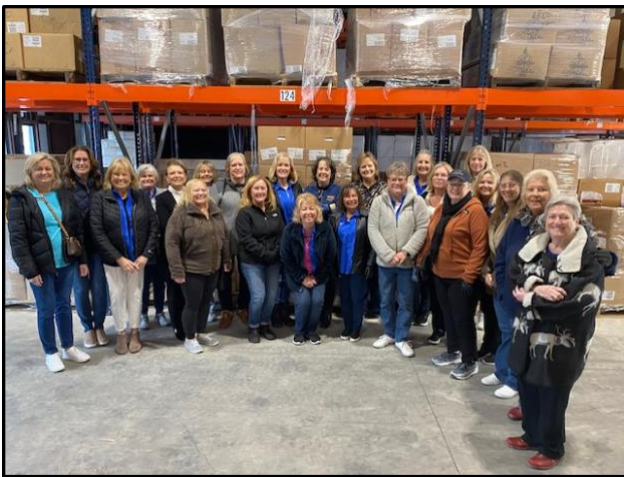
Women's Civic Club Volunteers